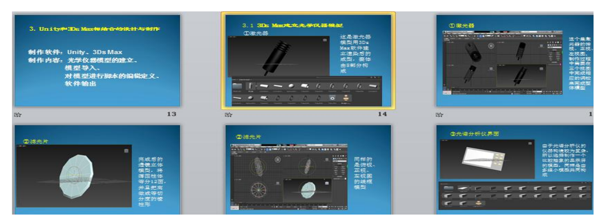
c) Online virtual lab