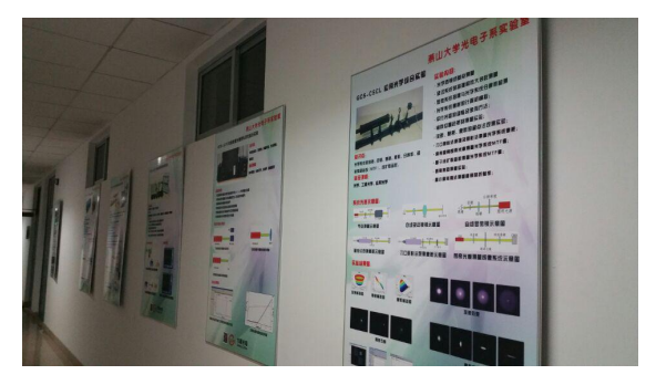
Fig.1 The access the knowledge content from anywhere