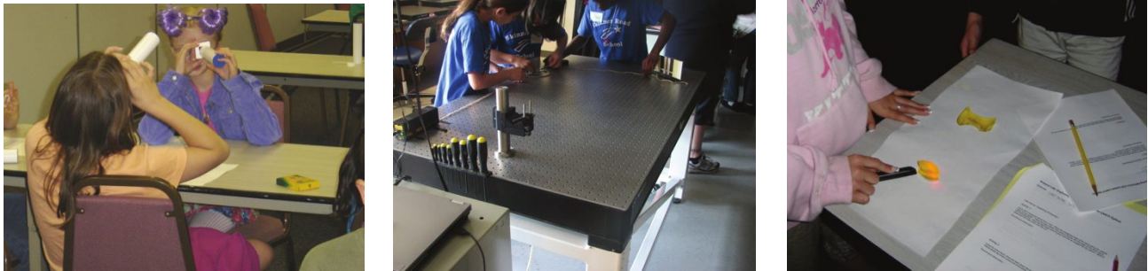
Figure 1. Fifth grade students learn optics through (left) Exploring Light Spectra (middle) Laser Target Shoot and (right) Exploring Refraction (gelatin optics).

High school Laser Camp focuses on college and careers in technology in general and optics/photonics in particular. Workshops include teambuilding among students from rural and city high schools and an exploration of college and career pathways. Exploring Polarization and Laser Target Shoot (with multiple mirrors) are popular workshops for this group. The activities are tailored for the older high school audience to include industry applications of the optics concepts presented. For example, examining students' eyeglasses between crossed polarizers leads to a discussion of the use of polarized light for stress testing. For an application of reflection, students examine the beam delivery system of a 45-watt CO 2 laser engraver and then use the system to create individualized wooden key tags. Pre and post testing indicates that the workshops have been very successful at introducing basic optics/photonics concepts and, more important, teaching students about career opportunities available with an associate degree in a technology program.