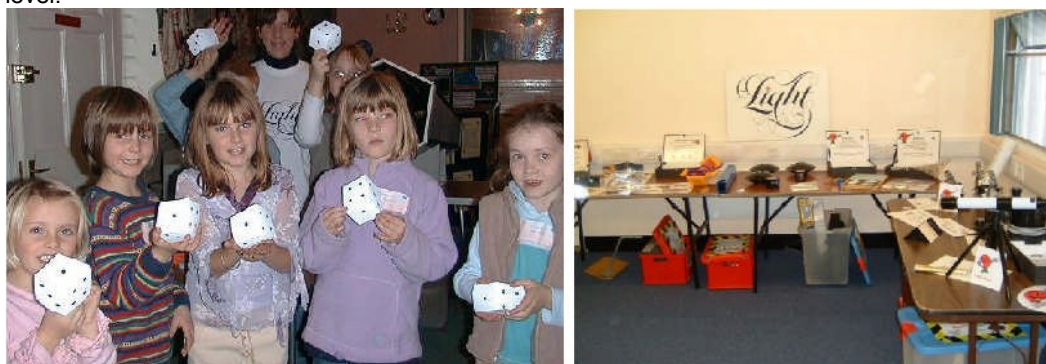
Figure 5: a) Results of the 'hands on' section, and b) the Lightwave kit.

As with any scheme of this nature, challenges arise from the issues of communicating with an audience of mixed ability. This challenge is particularly prevalent in shows where the audience is of a mixed age, especially at events such as science fairs, where accompanying adults may have their own, more advanced questions. To overcome this issue, the audience is split into small groups of 5-10 children. Within these groups, it is easier for the supervising volunteer to ensure that every child's needs are met, and that they can enjoy each experiment at their own level.