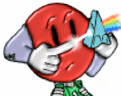
Figure 2: a) 'The Cube' optical illusion demonstration in the eye section and b) Phil Photon, Lightwave's mascot.