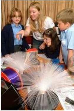
Figure 4: Images from the communicating with light section.