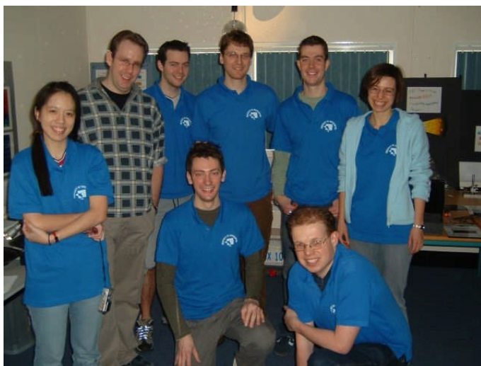
Figure 1: Lightwave volunteers from the Southampton University OSA Student Chapter

It is widely recognised that a child's negative image of an archetypal scientist begins to form at a young age [1]. It is believed that this negative image can influence a child's choices in education path and hence career [2], as seen in the current decline in the number of students choosing to study physics after the age of 16 [3]. Indeed, recent research has shown that the opinions and aspirations held by 11-year-old children towards post-compulsory education are unlikely to change by age 16 [4]. The following paper describes the use of an interactive Roadshow to