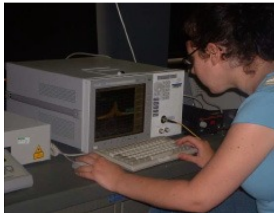
Fig. 2 Students use the optical spectrum analyzer to study laser modes in the Advanced Lightwave Communications Lab (2003)

The telecommunications industry downturn has had an unexpected bright spot; laboratory equipment and instrumentation is inexpensive and companies find tax deductible donations to the College attractive. Due to a state budget crisis and severe cuts to the college budget, the college was unable to make a cash match to the equipment portion of the grant. However, the industry downturn resulted in large donations from downsizing companies, including two complete fiber optics workstations, two Newport fiber optics education kits, and two Newport optics education kits from JDS Uniphase. In addition, once prohibitively expensive components are available through Internet auction and surplus sites at pennies on the dollar. The combination of declining prices for instrumentation and donations from industry have allowed the project to complete purchase of all the requested equipment as well to purchase additional tools and inspection instruments to supplement the original lightwave lab.