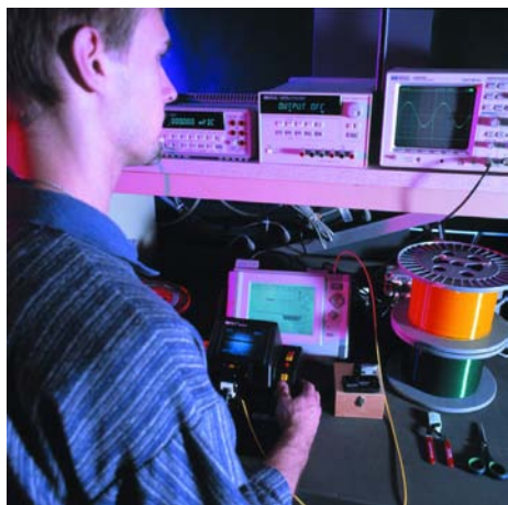
Fig..1 Students practice fiber splicing and use of the OTDR in the Lightwave Communications Lab (1999)

The shared physics and electronics laboratories were clearly inadequate to house all the new equipment. An under utilized electronics laboratory was remodeled into classroom/laboratory space to house the program laboratories. Walls were painted dark charcoal gray and room darkening shades were purchased for the large windows. Movable wooden screens were built to serve as laser beam blocks. The adjoining faculty office allowed the classroom to be used between classes by students, who were encouraged to use the space to study, for internet access or to work on projects. Allowing students to use the classroom space to work together during their free time fosters a feeling of belonging. As one student stated, "We're the only program that has its own 'club house'." Nearby instructors are able to provide assistance when needed and ensure that rules are obeyed.