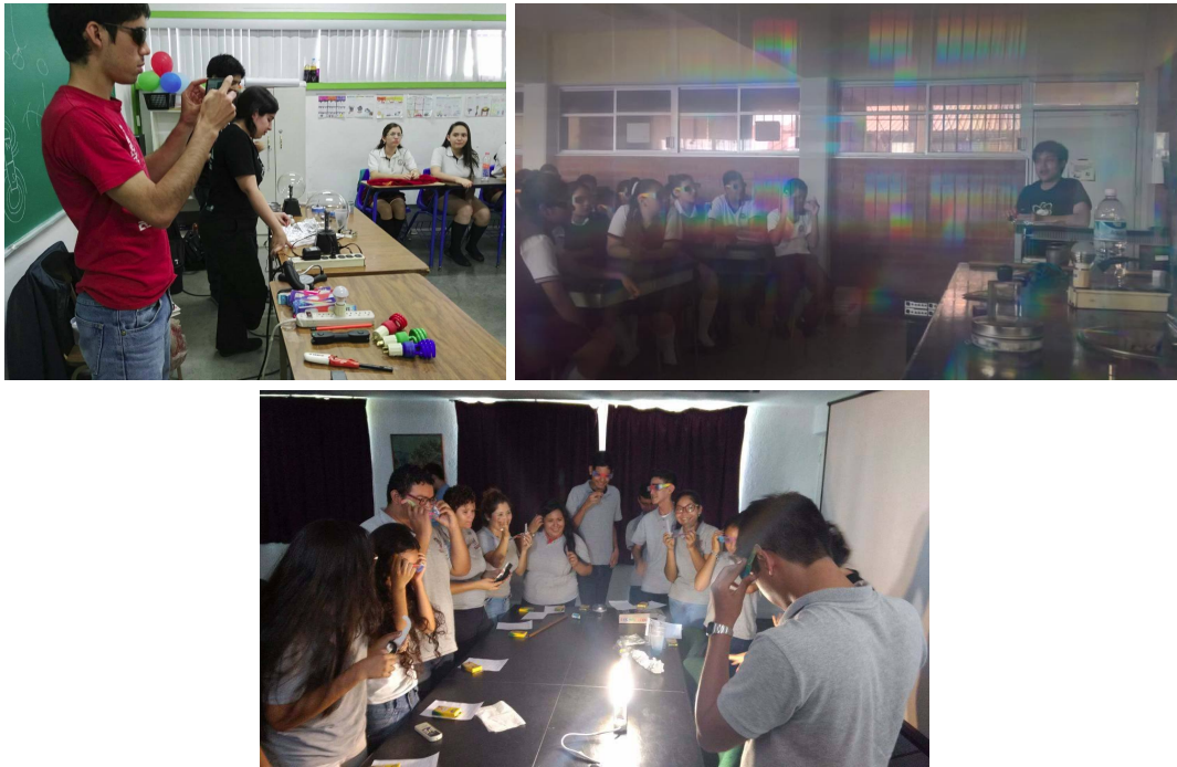
Figure 5. Visits to schools.