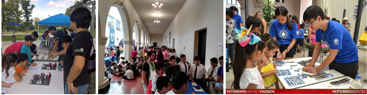
Figure 4. Public events.