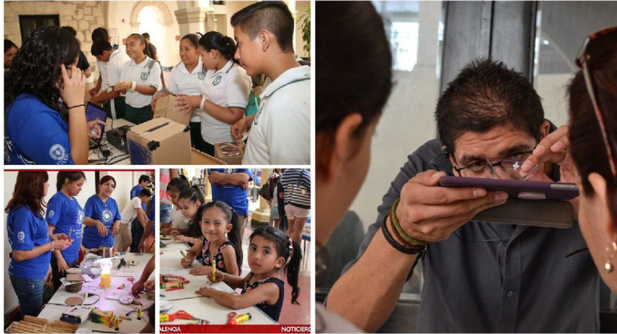
Figure 1. Examples of hands-on optics activities performed during our events.