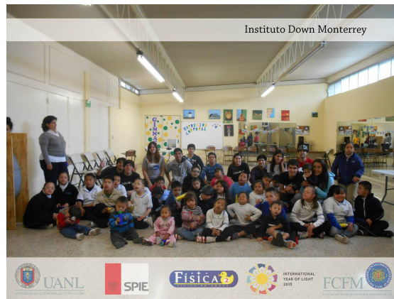
Figure 7. First activity of the program Optics for everyone at the Instituto Down Monterrey.