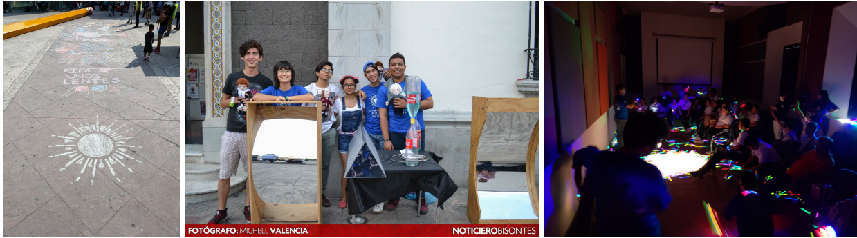
Figure 3. International Day of Light events that include artistic and cultural activities

and include artistic and cultural activities related to Light.