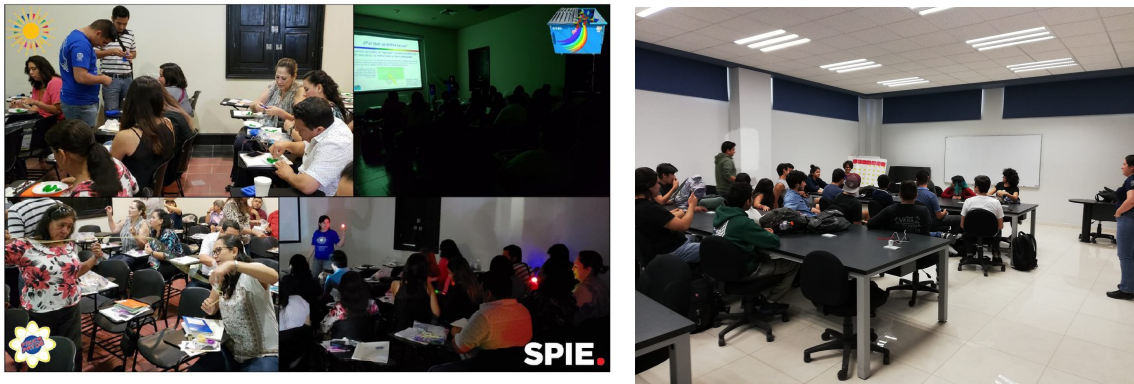
Figure 2. a) Dumpster Optics Workshop 2018. b) Physics for everyone volunteers taking training in fall 2018